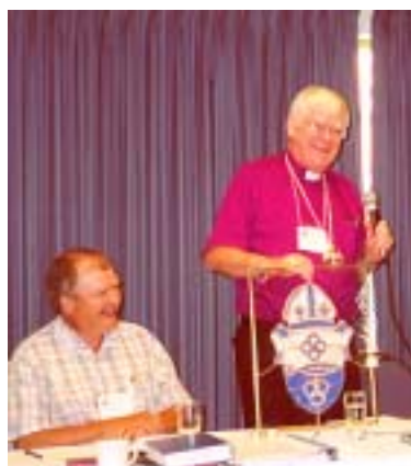
A farewell gift from the synod to the Primate.