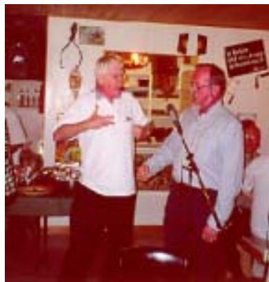
The Primate and the Archdeacon sing for their supper.