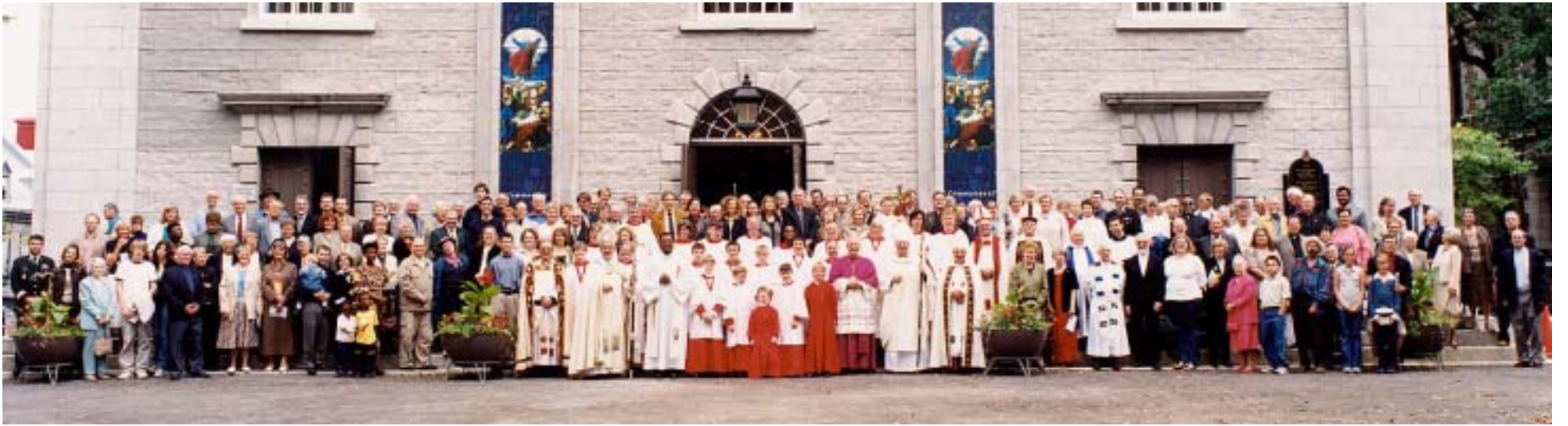
The congregation, with all 9 bishops (including one cardinal elect), that attended the official launch of The Cathedral of the Holy Trinity's bicentennial celebrations at a festive liturgy that took place as part of Provincial Synod on Sunday, September 21

VOL 110 Number 3 Reporting on our diocese since 1894 NOVEMBER 2003