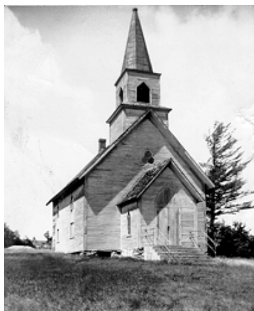
St. John's Gallup Hill, June 1950